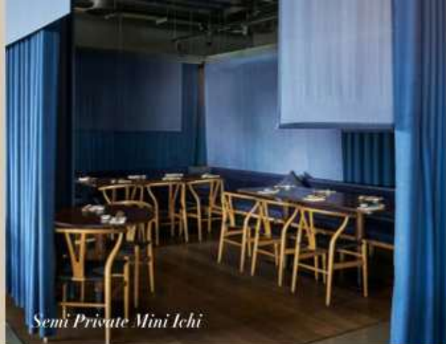
Semi Private Mini Ichi