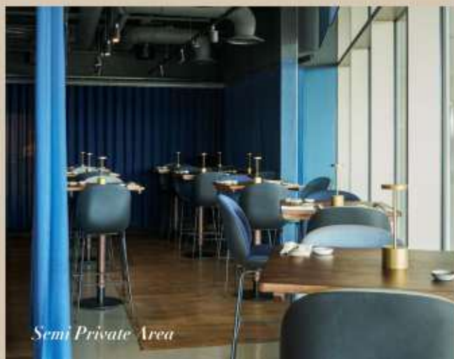
Semi Private Area