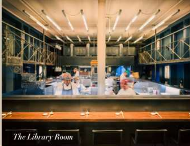
The Library Room