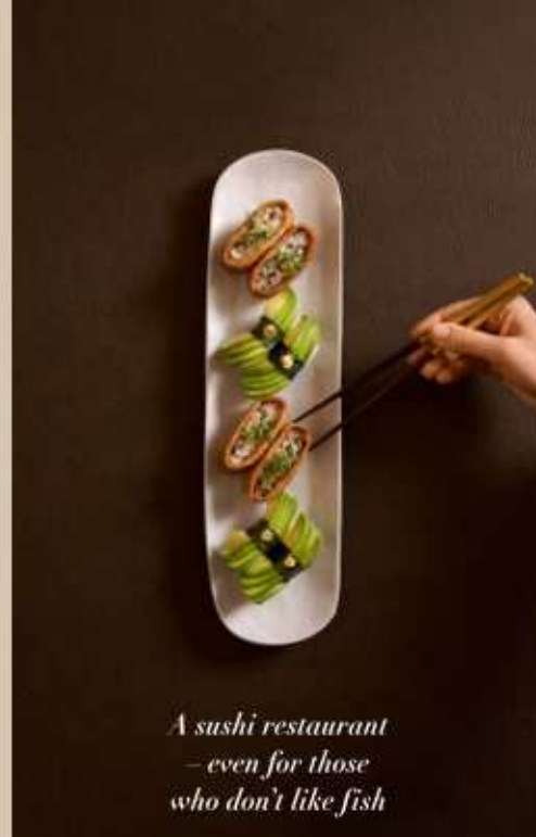
A sushi restaurant – even for those who don't like fish