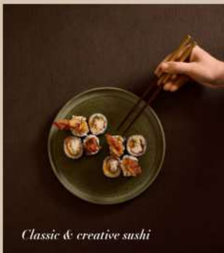
Classic & creative sushi