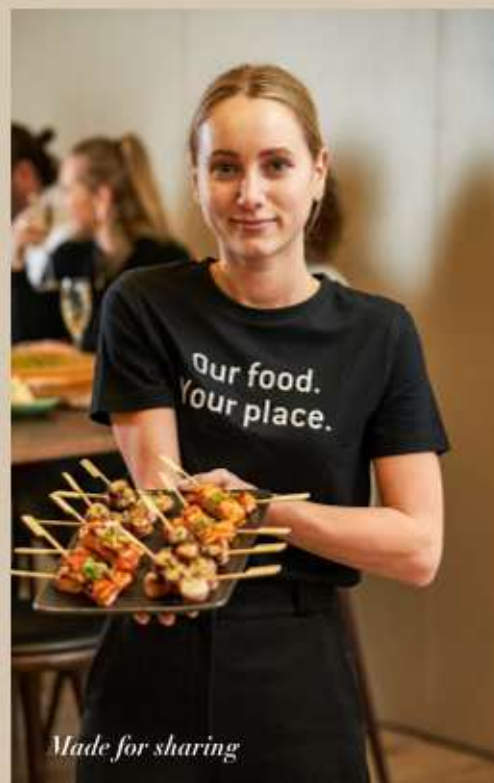
Made for sharing