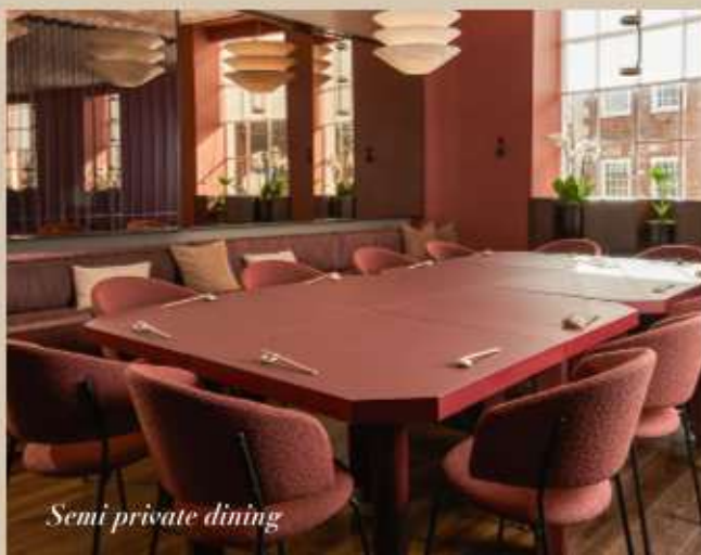
Semi private dining