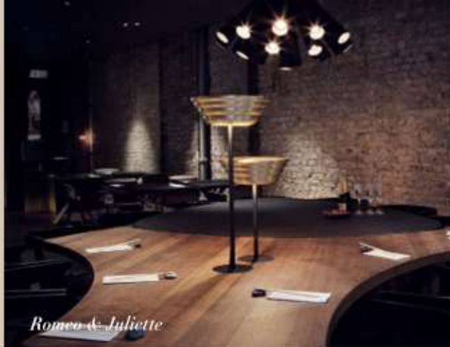
Romeo & Juliette