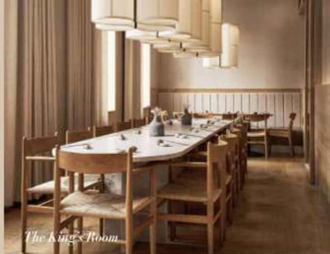
The King's Room