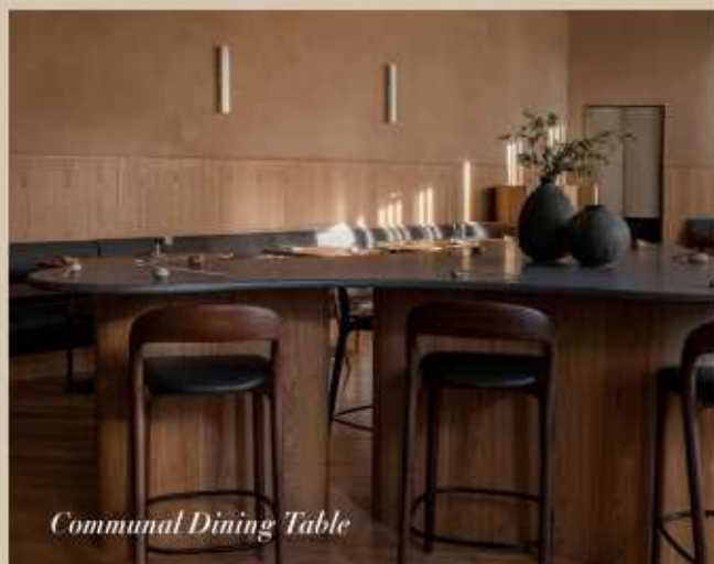
Communal Dining Table