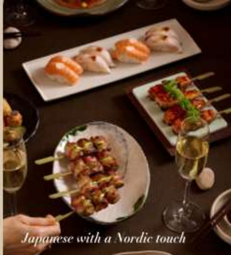
Japanese with a Nordic touch